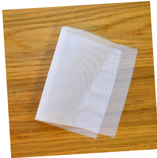
Fold over the voile.