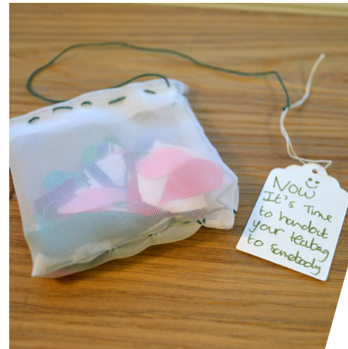
Attach a label and write your message.