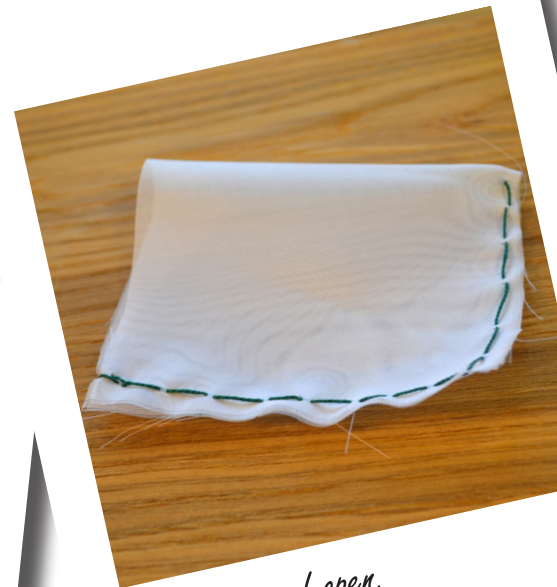
Leave one end open.