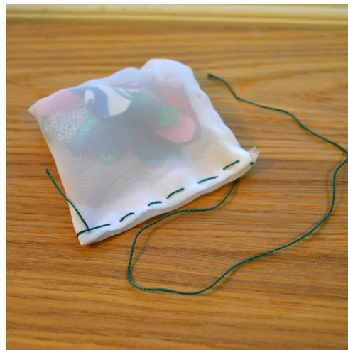
Stitch across the final side to close your tea bag.