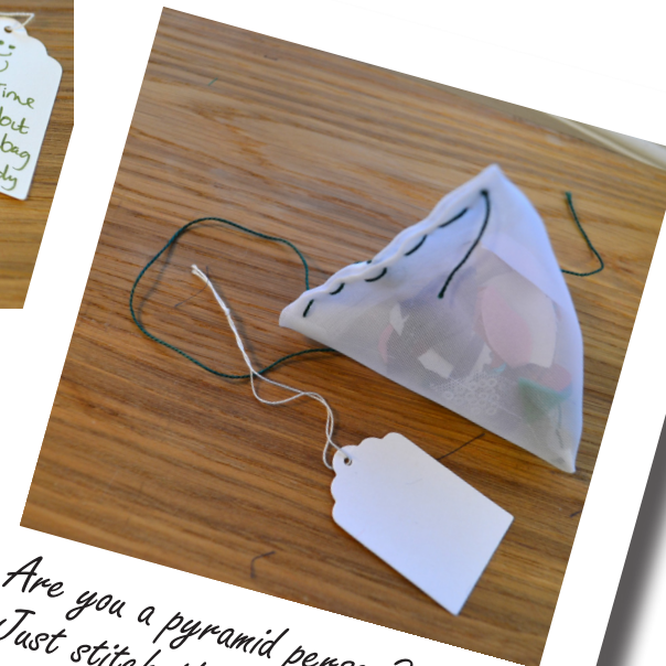
Are you a pyramid person? Just stitch the sides together with the side seam in the centre.