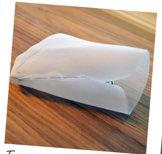
Turn your tea bag inside out.