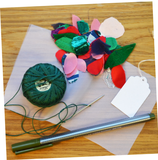
Tea 4 Change tea bag making kit: cotton, fabric and paper leaves, voile, needle, label and pen.