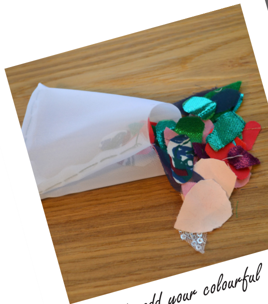
Ready to add your colourful leaves.