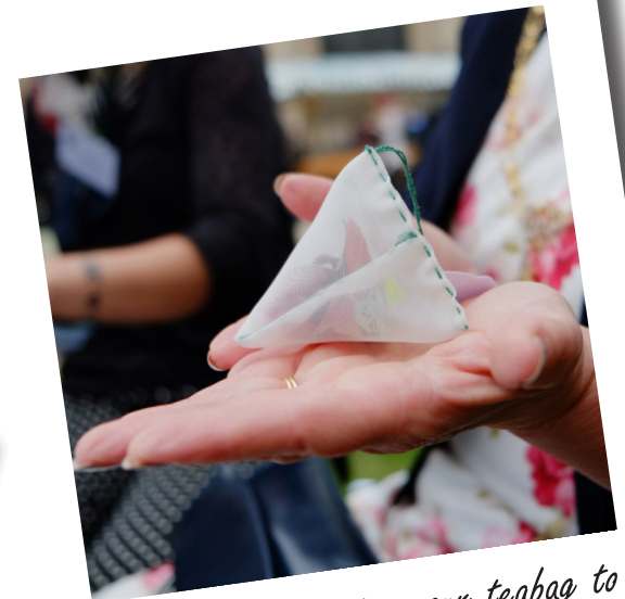
Find someone to give your teabag to and enjoy talking to a new friend.